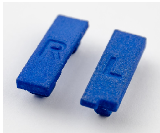
set consisting of left and right protective cover