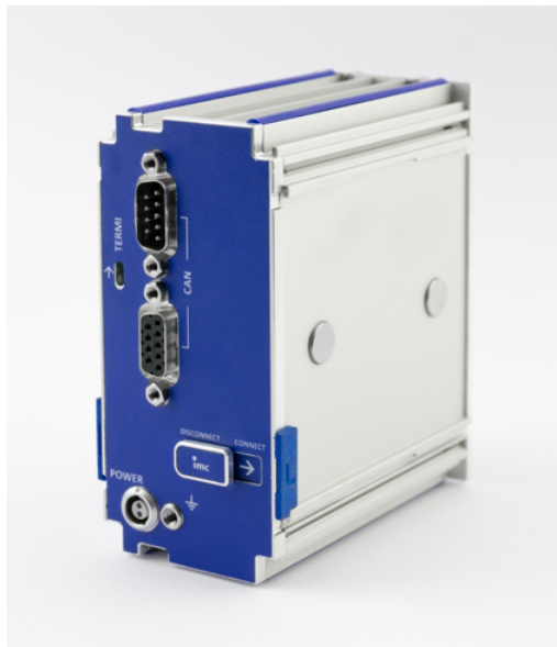
protective cover left (labeled with "L")